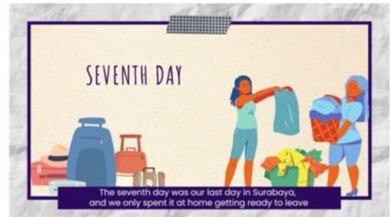
Fig. 7. Events of middle achiever recount digital storytelling.

According to figure 7, it can be assumed that the student is aware of the function of events in recount writing. The student compiled her events in chronological order by using linguistics features such as “On the third day” which shows temporal expression. The phrase “I was amazed when I first saw this mall” focuses on the use of simple past tense, the same goes to action verbs that are also used in her content, begins with the phrase ‘see’, ‘walked’, and ‘took’. Meanwhile, the phrases such as ‘on the second day’, ‘on the third day’ and ‘the following day’ refers to the usage of temporal conjunction in order to retell events in chronological order. Although the story is telling the story of the student specifically, the usage of pronoun “we” in the story is quite excessive. Therefore shifting the specific participants in the story to “we” instead of the student herself.