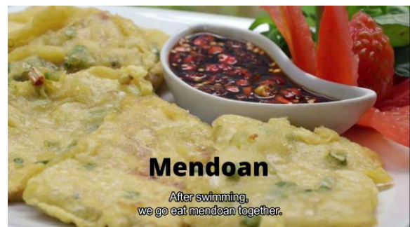
Fig. 11. Events of lower achiever recount digital storytelling.

Below is another example of events in the student's recount