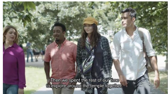
Fig. 4. Events of higher achiever recount digital storytelling.

Below is another example of events of the student's recount: