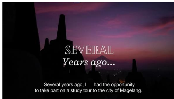
Fig. 2. Orientation of higher achiever recount digital storytelling

pronunciation, as seen in the example below: