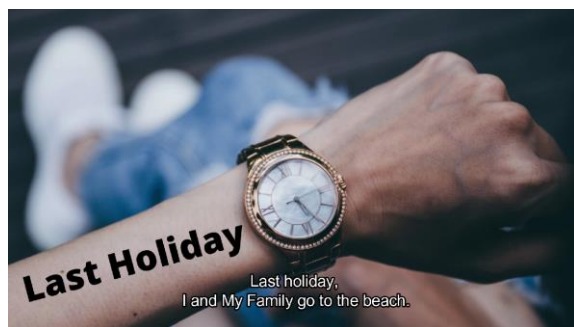
Fig. 9. Orientation of lower achiever recount digital storytelling.

The researchers also found several results that does not meet the basic standard requirements for recount writing during the observation. These results belong in the lower achiever category. The students in this category does poorly in terms of compiling both written and video quality. It means that don't have schematic structures, contains grammatical errors, mispronunciations, lack of linguistics features, and missing structure as seen in the example below: