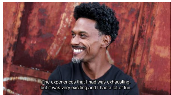
Fig. 5. Reorientation of higher achiever digital storytelling.

The figure below is the reorientation of the student's recount: