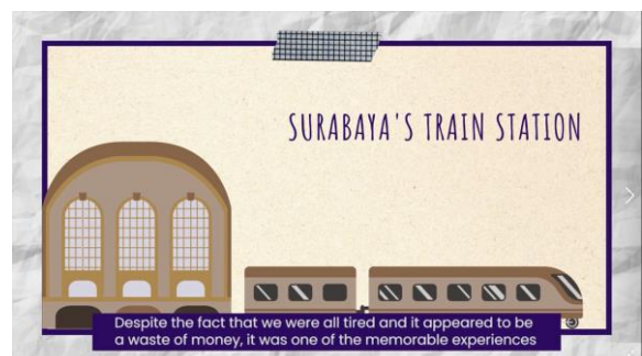
Fig. 8. Reorientation of middle achiever digital storytelling.

The figure below shows the reorientation of student’s recount: