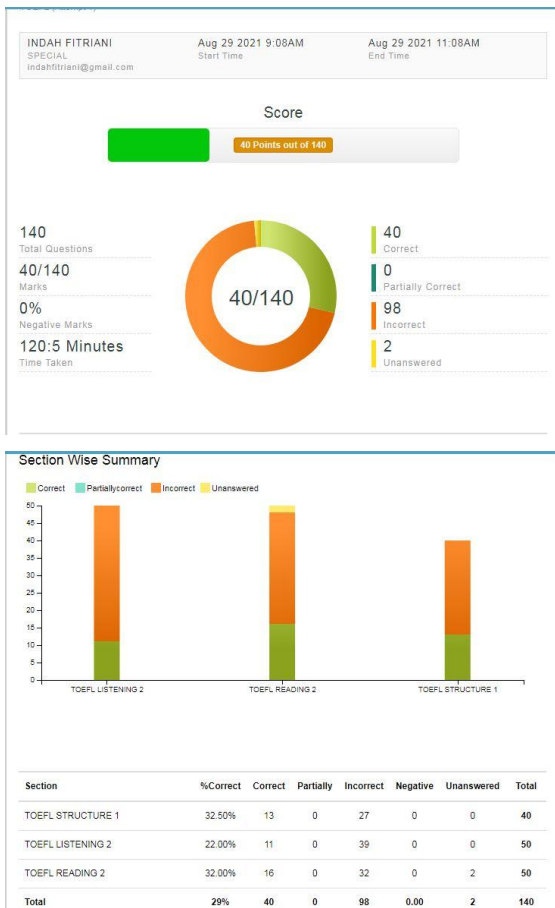
Figure 4. Instant Test Result from Test Participant (downloadable)