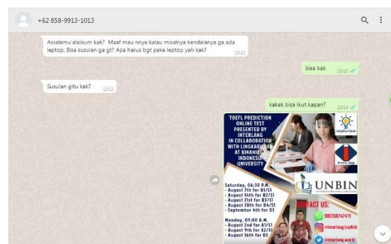
Figure 6. One of Test Participants who had Test Equipment Problem