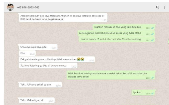
Figure 5. One of Test Participants who had Problem Connection