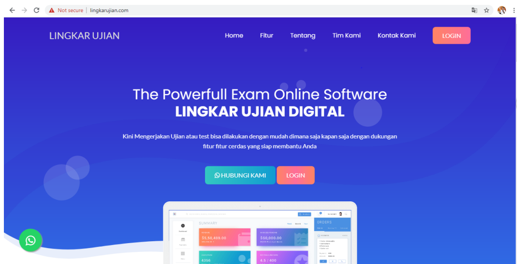
Figure 8. Page from www.lingkarujian.com