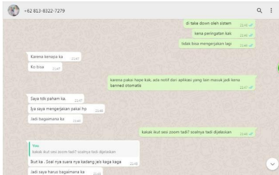
Figure 7. One of Test Participants who was lacking in software knowledge