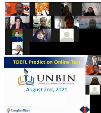
Figure 2. Zoom Meeting Conducted by www.lingkarujian.com (go to https://youtu.be/X_zM8Fmq3Fo for full video)

First, authors conducted the TOEFL prediction online test by giving PPT guidance on how to enter the website ( www.lingkarujian.com ) and login using their test account to do the test. Next, authors held a Zoom meeting to explain what is TOEFL prediction online test used for and how to do the online test remotely from home. Then, the result of the test counted quantitatively and presented in chart. Last, problems found would be delivered by test participants using Whatsapp to the test proctors.