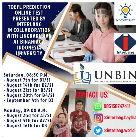
Figure 1. TOEFL Prediction Online Test conducted by lingkarujian.com for Universitas Binaniaga Indonesia

On this research, authors got some help from an institution which given TOEFL prediction online test, www.lingkarujian.com , to gather data of 242 students from Binaniaga University who will have their thesis trial for 2020/2021 academic year.