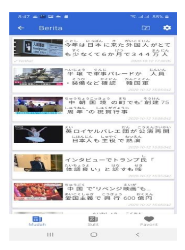
Figure 2. Mazii News Column.

When you click on the news feature, you will presented with various kinds of news that are happening around the world. In the bottom column there are easy, difficult, and favorite post. Easy writing is news that is presented in an easy to understand language, while what is written in difficult is the news that is presented exactly the same as the news posted on NHK, TBS, and other news channels. To facilitate learning, video, and sound are also embedded in each news feature, so that learners can listen while viewing the text of each news.