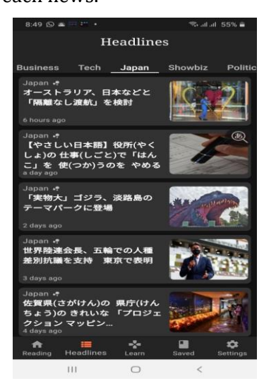
Figure. 3 Jareads Feature.

When you click on the news feature, you will presented with various kinds of news that are happening around the world. In the bottom column there are easy, difficult, and favorite post. Easy writing is news that is presented in an easy to understand language, while what is written in difficult is the news that is presented exactly the same as the news posted on NHK, TBS, and other news channels. To facilitate learning, video, and sound are also embedded in each news feature, so that learners can listen while viewing the text of each news.