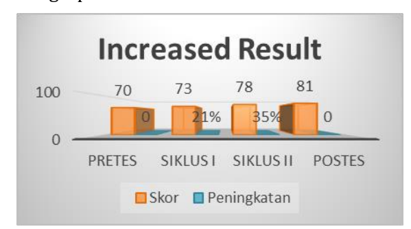
Graph 1. Increased Pretest to Posttest Score

Data collection from this research was carried out 7 times. The first is a pre research to see how far the respondents understand the application that will be given. Then the end of each cycle a test is given to see the improvement that accurs. In this study the researchers set 2 meetings in each cycle. After each meetings, a reflection is carried out in the form of a test to see how far the respondents understand the material given. The results of the improvement obtained from research using mobile assisted language learning with the mazii and jareads applications are shown in the graph below: