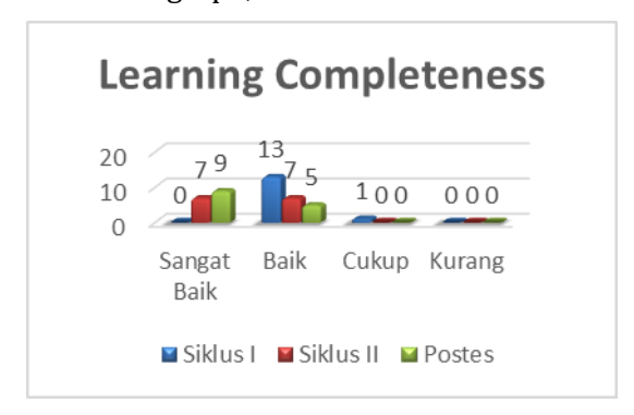
Graph 2. Overall Learning Completeness Value.

Complete learning from the beginning of the test to the end of the test, is presented in a graph, as below: