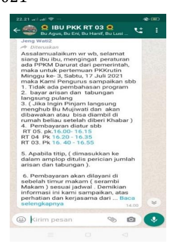
Figure 3. Screenshot of Whatsapp Group of PKK RT 03 ladies

The picture above shows that the PKK management in Wonorejo hamlet continued a message from the main PKK group RW 08 which contained information via Whatsapp group belonging to PKK women RT 03 Wonorejo hamlet regarding the implementation of the 3rd week regular PKK meeting. The contents of the information above are that with the 'PPKM Darurat' regulation still in effect, regular PKK meetings are not discussed, pay arisan