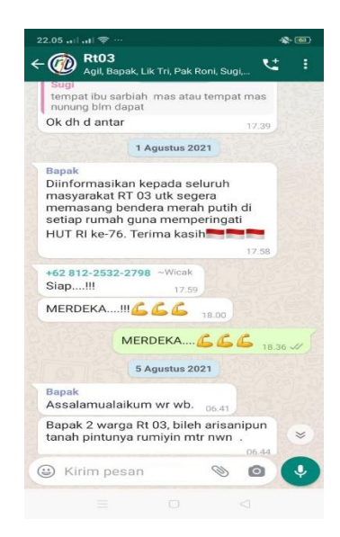
Figure 2. Screenshot of the Whatsapp group of gentlemen RT 03

outside the Wonorejo hamlet. In addition, there is an appeal to continue to wear masks. Then the Friday prayer only uses speakers in the mosque. With this information, it is hoped that the public can obey the rules of Friday prayer during the Covid-19 pandemic, especially during the 'PPKM Darurat' period.