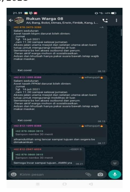
Figure 1. Screenshot of Whatsapp Group Rukun Warga 08

The picture above shows that the administrators of the hamlet institutions provided information through the Whatsapp group belonging to RW 08 Wonorejo hamlet regarding the implementation of Friday prayers and closing the mosque's main access road which aims to reduce the mobility of people